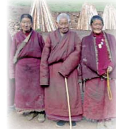
Senior nuns at the site of the future clinic

Situated at an altitude of 14,763 feet (4500 meters) on the grasslands of Nangchen, the Gebchak Clinic stands as a crucial outpost for primary and emergency healthcare for the region's largest Buddhist nunnery and surrounding nomadic communities. "To have this clinic in such a remote, isolated location is an enormous help" says Gebchak Nunnery's abbot. "The people that live in this area now feel confident and at peace, knowing that if they fall sick they have this clinic to go to." TBF provides healthcare training to nurses, doctors, monks, nuns and nomads who provide critical, frontline care to some of the most remote communities on the Tibetan plateau and builds, improves and equips clinics.